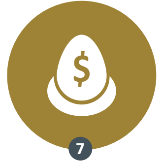
TOTAL WEEKLY BENEFIT FOR SELF FUNDED RETIREES $443

YOUR ESTIMATED WEEKLY COSTS SAVINGS FOR COUPLES LIVING IN A PROVIDENCE LIFESTYLE RESORT: