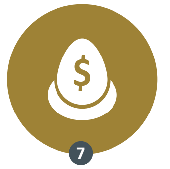
TOTAL WEEKLY BENEFIT FOR SELF FUNDED RETIREES $412

YOUR ESTIMATED WEEKLY COSTS SAVINGS FOR SINGLES LIVING IN A PROVIDENCE LIFESTYLE RESORT: