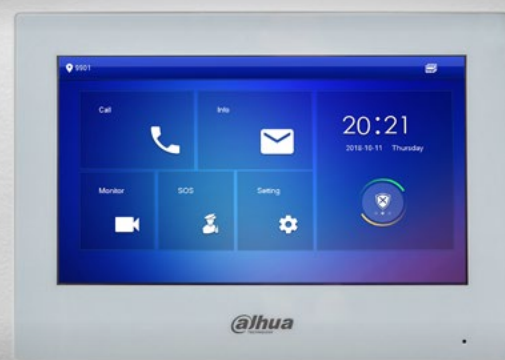
Audio and visual intercom to the Resort's entrance gates

To provide a stress free, faster and better experience to Resort Homeowners